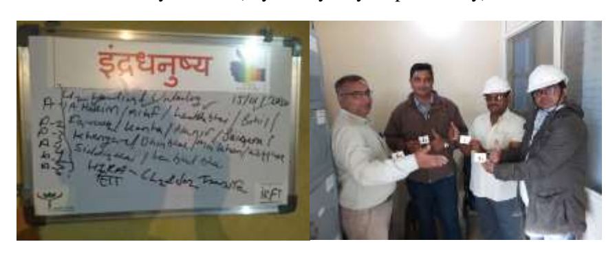
Karmacharis posing with Panchang—a daily reminder to remain safe during work operations