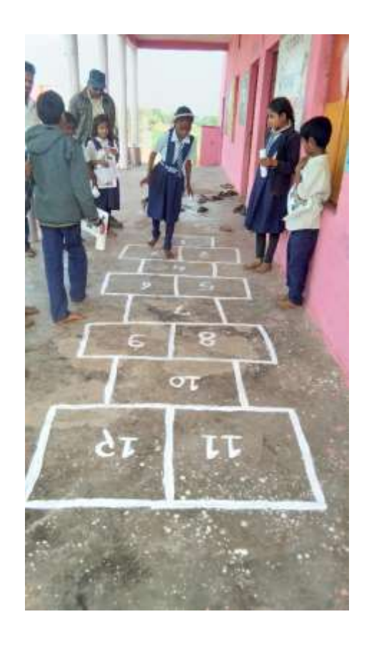
Children learning on the Health & Safety while playing Stapoo 'Learning by doing' in action