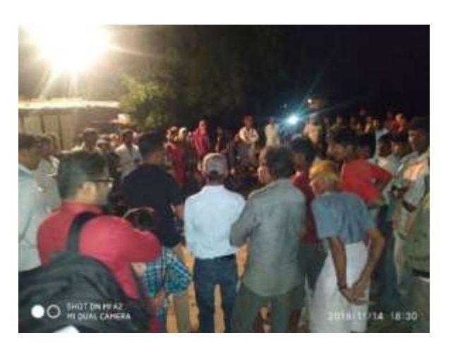
IRFT representative giving training to the farmers at a night meeting