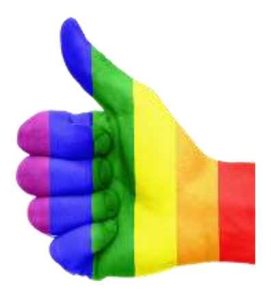
A symbol of (My Safety. My responsibility)