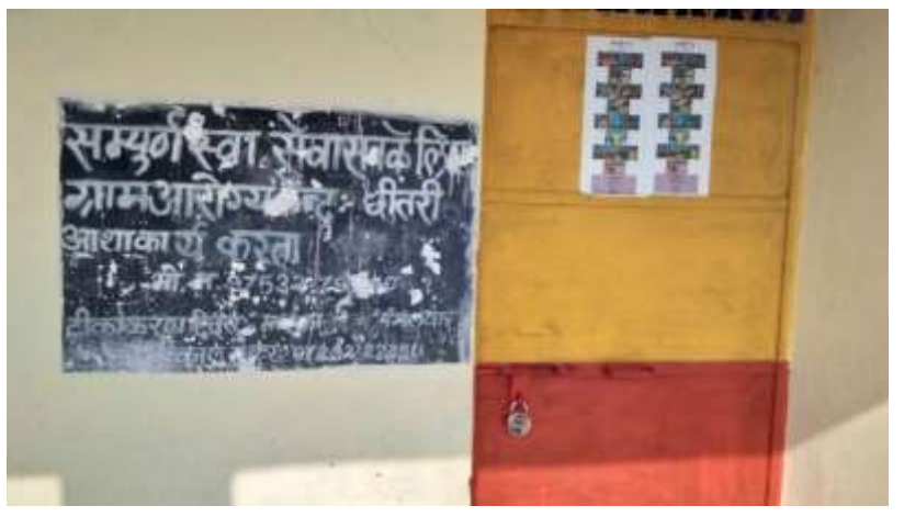
Posting Stapoo poster messaging, in Primary Health Centre Reinforcing Training Messages